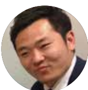
The Hungry One