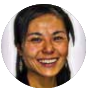
The Free Spirit