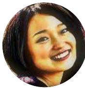
The Company Clown