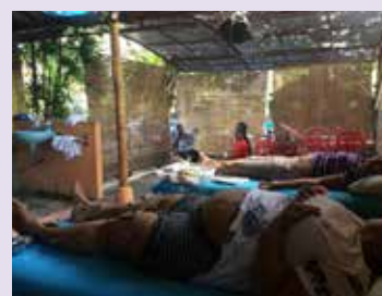
This is the acupuncture room at the Bali clinic in which expectant mothers receive pre-birth treatment. 20 years old, the building can no longer keep out the rain.

While it started out as a small clinic, Bumi Sehat today not only offers a wide range of health services from general medical treatments, eye checkups and home visits to alternative therapies such as acupuncture and traditional Chinese medicine. It also provides care for the elderly, training and scholarships for midwives and even coordinates youth education and local recycling programs.