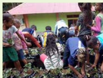
During weekends, LGS is packed with local children enjoying a course at the school