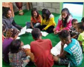
Even with limited supplies and equipment, the children eagerly participate in activities