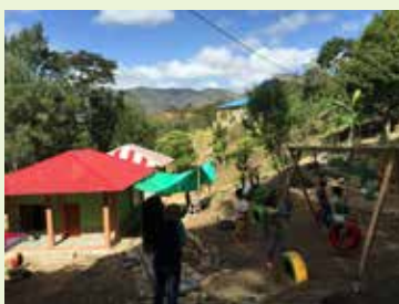
The school: (Front) classroom, dorm, playground and strawberry field (Back) the on-site restaurant